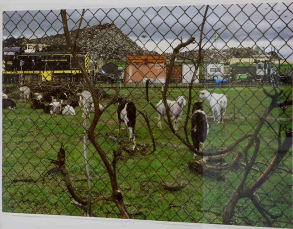
Wick Cragg The Plant, Redbank