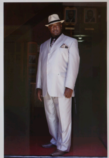
Portrait of a woman Full-length portrait of a man The artist's name is [illegible] sfac