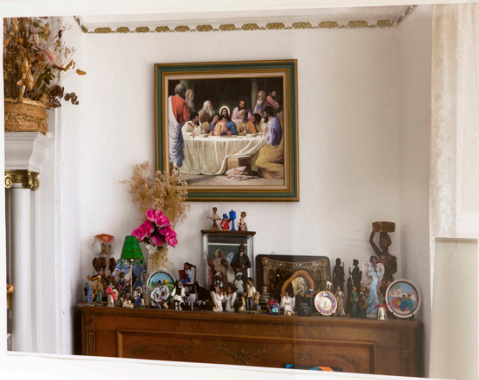
Inspiration Kiki Odeh The Last Supper The Last Supper The Last Supper The Last Supper sfac galleries