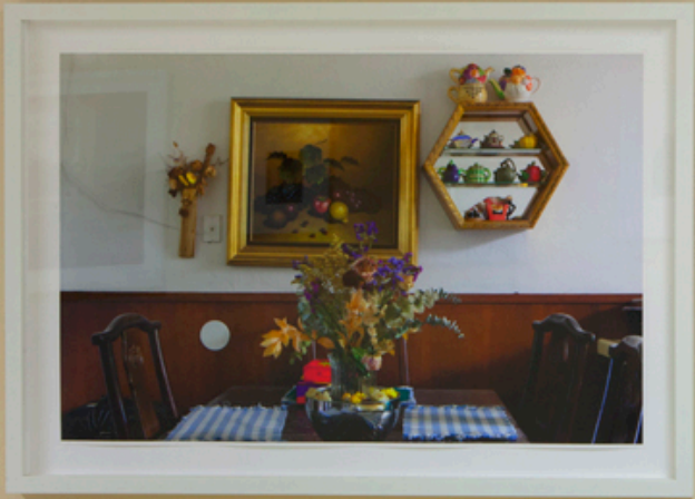
Don't Forget The Little Things